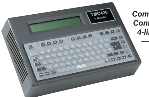
Compact TMC420 Controller features 4-line LCD Display — no PC required.